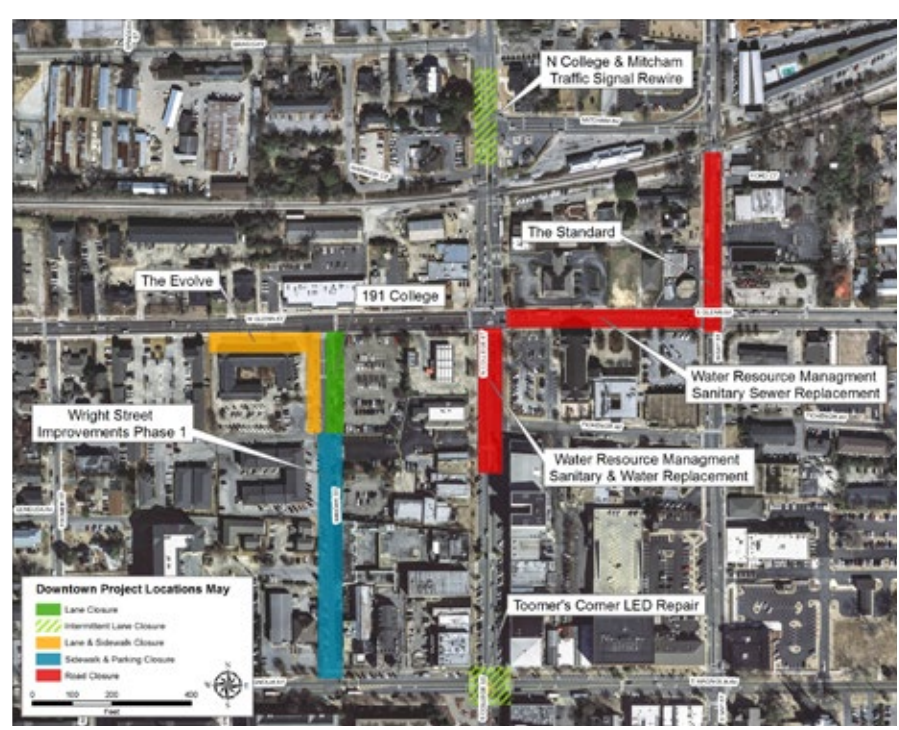
continued on next page

Sidewalk, parking and lane closures may occur Glenn Avenue and the north end of Wright Street as construction on The Evolve student housing project continues